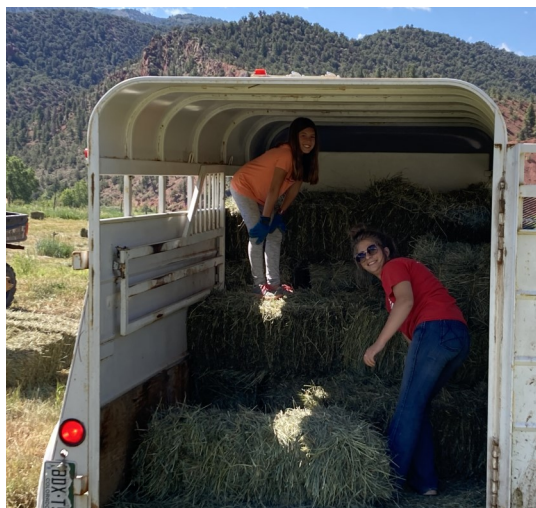
Volunteers helping unload hay, Summer 2021

Not only do these programs provide outreach and education about horses, as our mission states, but they also create an extended community of horse advocates. Some have adopted, volunteered, donated, and in other ways become involved with MVHR and the mission directly. And all of them have gone back out into the world with a love of horses in their hearts to share with others for years to come.