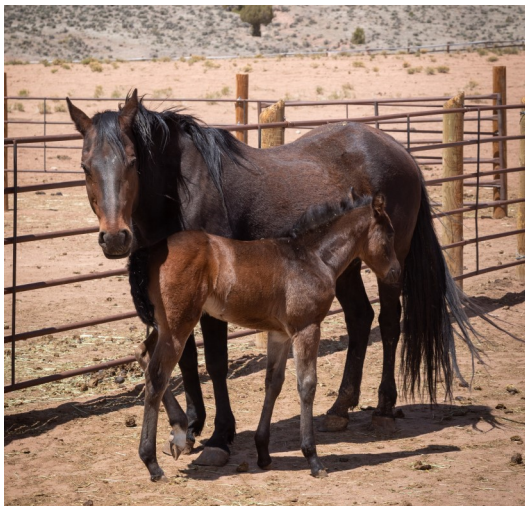
Tango & Cora B, born April 2021

Saying yes to more horses meant more hay, more vet bills, more training time. You were there to provide the support MVHR needed to make all of that possible for each and every one of our charges in 2021. Thanks to you, we were able to give each new intake the care that they needed and deserved, starting the moment they set foot at the MVHR ranch.