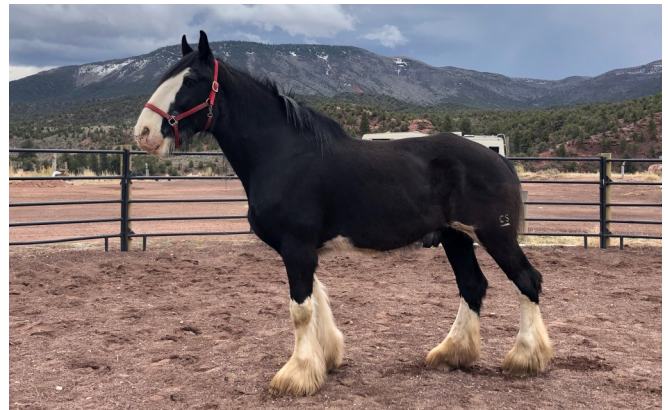
Herman, Adopted April 2021

Eighteen adoptions in 2021 included beautiful stories like Bonita's, who after many years at MVHR finally found a loving adopter whom she could trust. And Cora B, who was born right here on the ranch, and has gone on to a loving home, living an adventurous life in the mountains! Or remember the magnificent Shire, Herman, who was only here a few weeks before heading off to Montana with a new family of his own? Each adoption story has its own foundation of trust, which begins with the horse's time here at MVHR and their eventual connection to a new person.