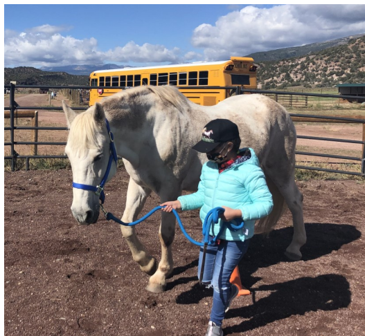
Program participant leading a horse

In addition to MVHR's equine programs, we welcomed a variety of community partners to introduce horses to their respective communities. A few of those partners include Mountain Recreation, YouthPower365, Eagle Valley Outdoor Movement, Vail Mountain School, and many grade levels from Eagle County Schools.